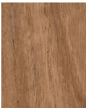
Saddleback Spotted Gum

Our 4.5mm vinyl range is the definition of comfort and style. Featuring a resilient 0.5mm wear layer, this high-quality flooring offers exceptional value. It comes in a selection of contemporary designs, with extra thickness delivering additional underfoot comfort.