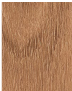
Avoca Spotted Gum