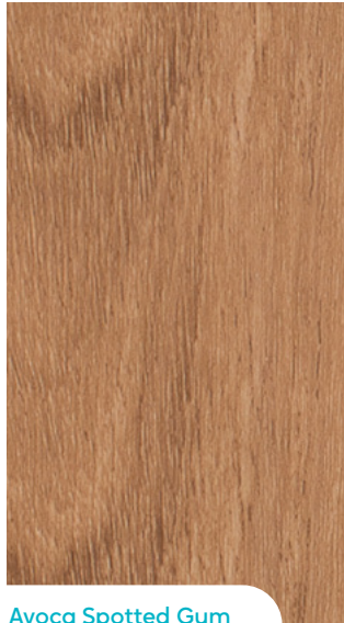
Avoca Spotted Gum