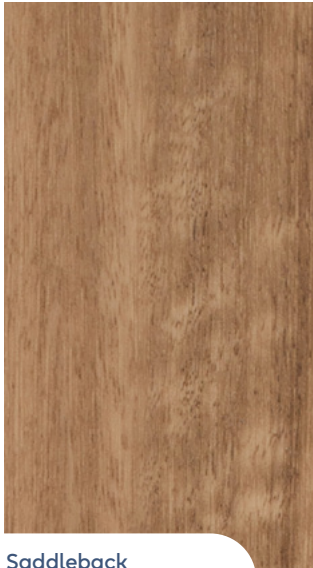
Saddleback Spotted Gum